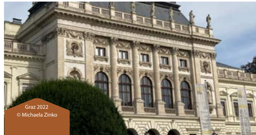
Graz 2022